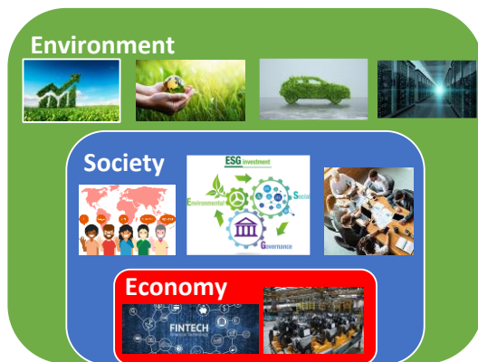
Figure 2: Sustainable Graph-Massivizer use cases, constraining economy and society by environmental limits.

Graph-Massivizer selects four real-world use cases with complementary economic, social, and environmental sustainability profiles, depicted in Figure 2. They must tackle complementary extreme data processing and MG analytics challenges, going in order of magnitude beyond big data in at least three “V” characteristics. Graph-Massivizer proposes a novel characteristic called “Viridescence”, representing the sustainability of processing extreme data from an environmental perspective. Table 1 summarizes seven characteristics enhanced through Graph-Massivizer from “big-to-extreme” dimensions and their balanced distribution across the four use cases.